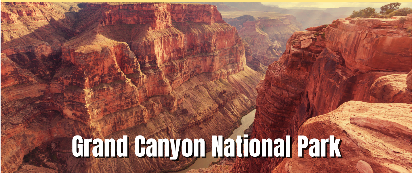
Grand Canyon National Park